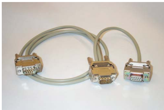
Fig. 1: Y-cable 7XV5104