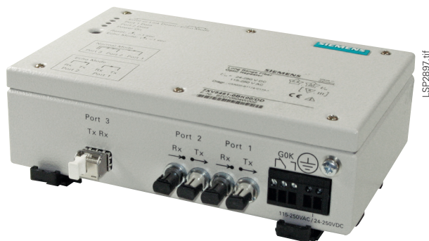
Fig. 13/20 Optical repeater with integrated 1300 nm/1550 nm wave length multiplexer for one single mono-mode FO-cable