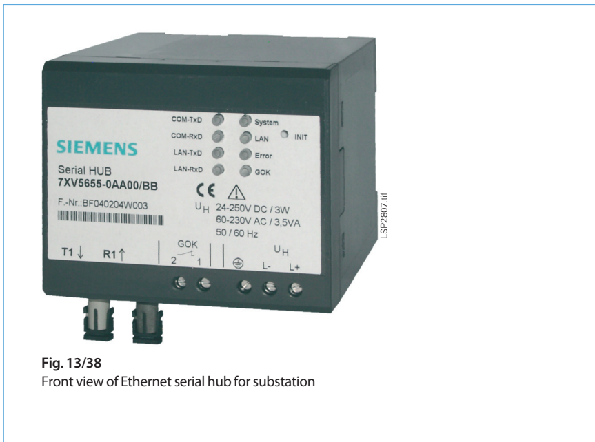
Fig. 13/38 Front view of Ethernet serial hub for substation