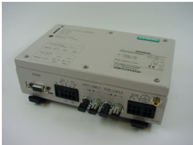
Figure 1: Communication converter

4 LED: 1 Green – power supply. 1 Red – Fault alarm. 2 yellow – data traffic