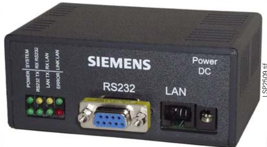
Fig. 15/71 7XV585x Ethernet modem