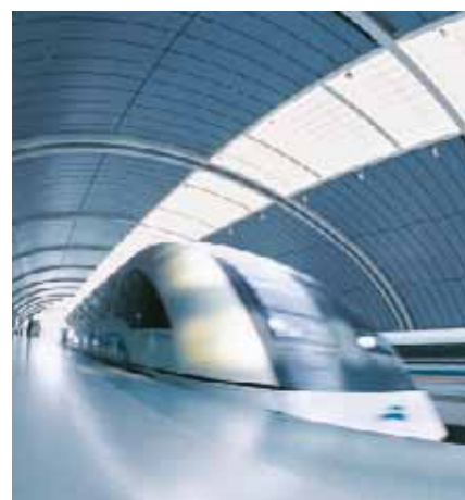
With 430 km/h to the airport in Shanghai