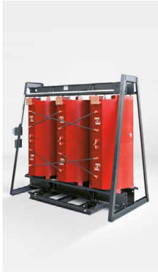
7.5-MVA GEAFOL transformer for extremely low ambient temperatures down to -55°C