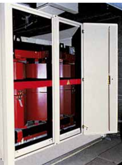
On the high sea: GEAFOL goes on board

Because of the positive experience gained with these transformers, the Oseberg platform was also correspondingly equipped in 1988. It has 23 transformers on board, corresponding to the power requirements of a town with 40000 people. In the meantime, a large number of offshore platforms have been equipped with GEAFOL transformers and further platforms are being built.