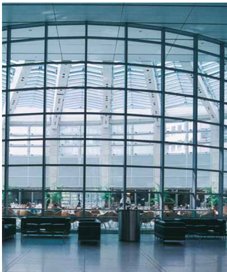
Power supply for Europe's tallest office building with GEAFOLE