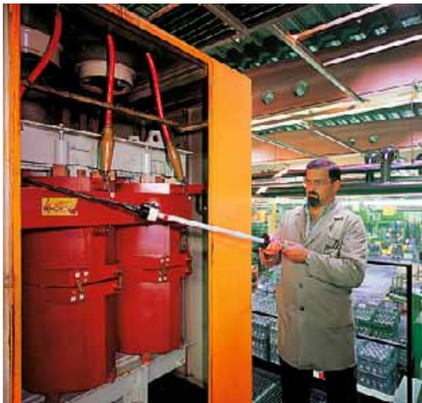
Twenty years of daily operation in an aggressive environment with low maintenance costs