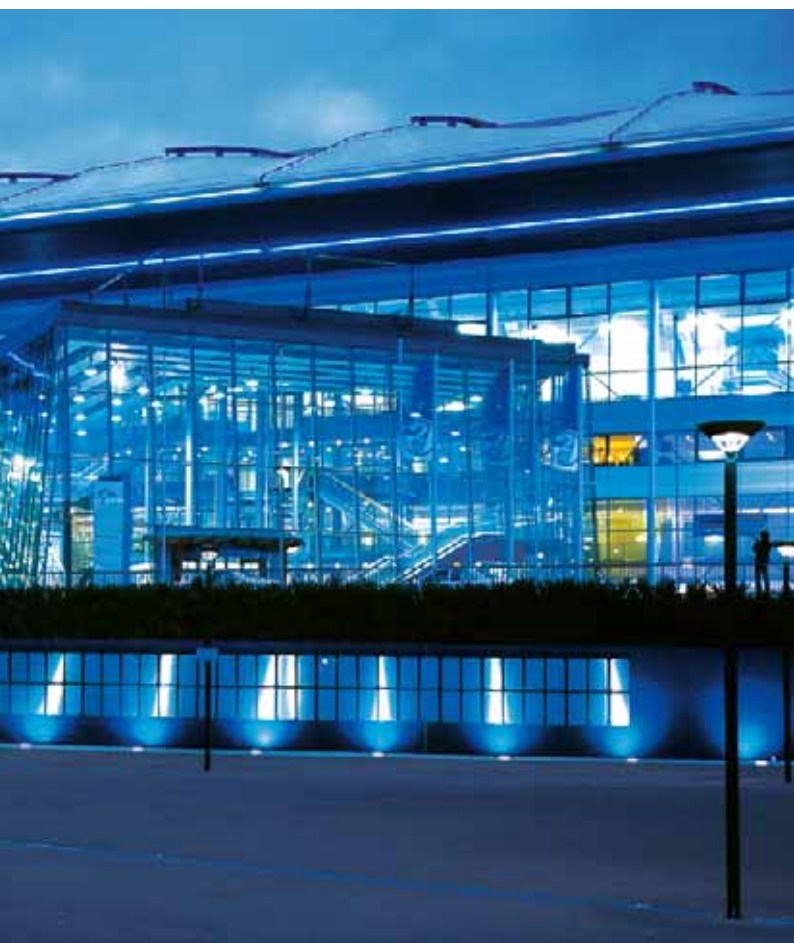
Veltins-Arena, Germany – powered by GEAFOLE