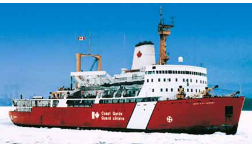
North of the Arctic Circle: with GEAFOL on board the ice breaker