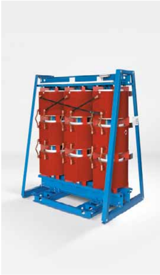
GEAFOL-Static Converter 3-tier design