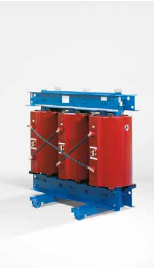
GEAFOL cast resin transformers Standard model with 1000 kVA

Power ratings up to 40 MVA can be achieved by GEAFOL transformers today without any problem.