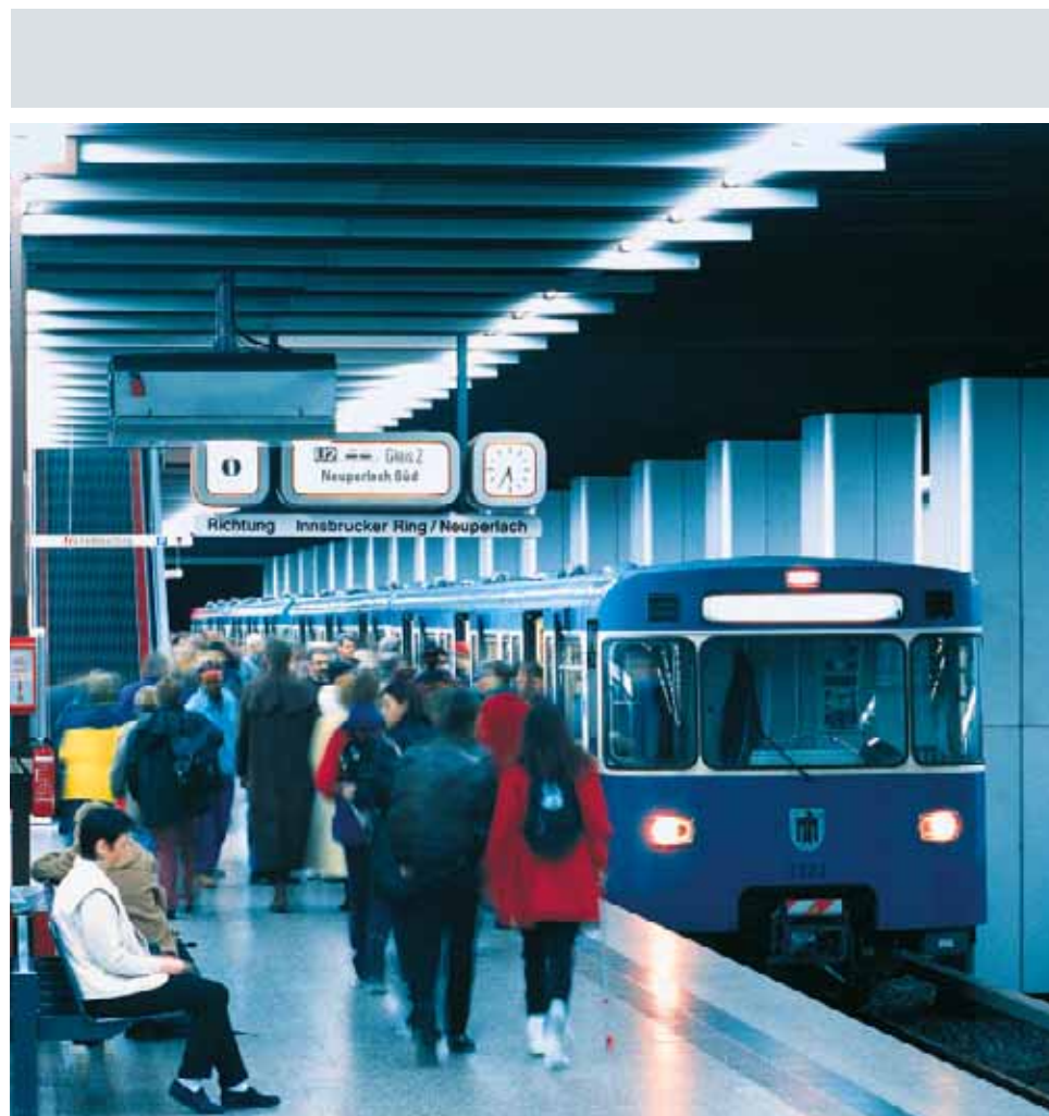
Problem-free traffic: GEA FOL in the subway in Munich

Special attention had to be paid to the important linear motor parameters, e.g. operating frequency, harmonics and inverter-dependent DC current components. Because of the high reliability of the GEA FOL transformers, operation under these stringent conditions is not a problem.